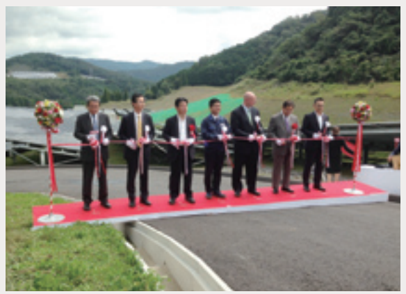
Mimasaka Musashi Mega Solar Power Plant completion ceremony

Operations management, maintenance and inspections services at the Furukawa Mega Solar Plant will be carried out by TAG O&M Services K.K. over the next 20 years. In order to provide those services to solar power plants, the company was formed in February 2016 through a joint investment by three companies: TOYO's group company TEC Project Services Corporation (TPS), building maintenance industry pioneer GLOBESHIP Corporation, and ATOX Co., Ltd., a company with a proven track record in nuclear power plant maintenance.