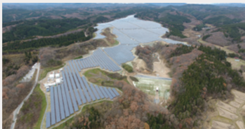
Furukawa Mega Solar Plant