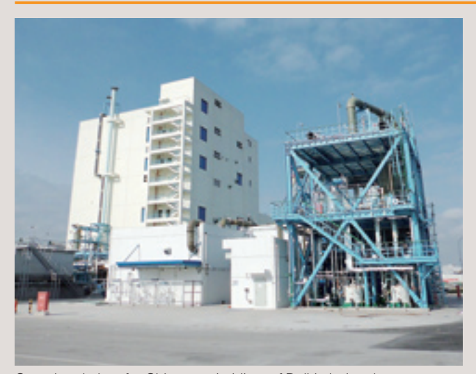
Completed plant for Chinese subsidiary of Daikin Industries

Last year, Toyo-China completed three projects in China. In June 2014, the company finished construction of a specialty ester manufacturing plant in Nanjing, Jiangsu Province for OXEA, a major German specialty chemicals producer. Construction of the plant took 25 months, during which Toyo-China provided EPsCm.*1 The company also achieved one million hours of incident and injury free operations during the project. The ester plant was OXEA's first production facility in Asia.