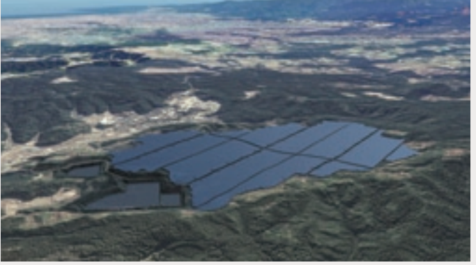
Panels are an artistic rendering (Left: Okayama prefecture, Right: Miyazaki prefecture)