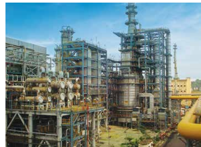
C2, C3 & C4 Extraction Plant with Truck Loading System, Dahej, Gujarat, India Client: Oil And Natural Gas Corporation