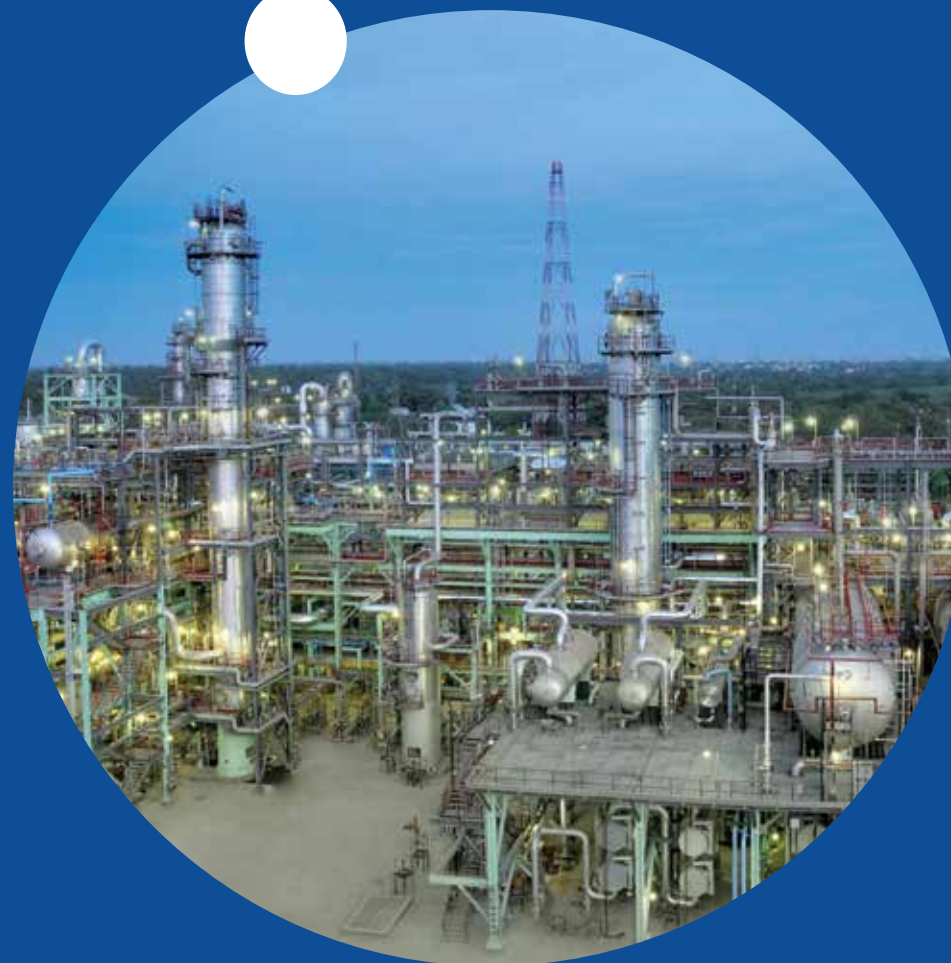
OIL & GAS, REFINERIES