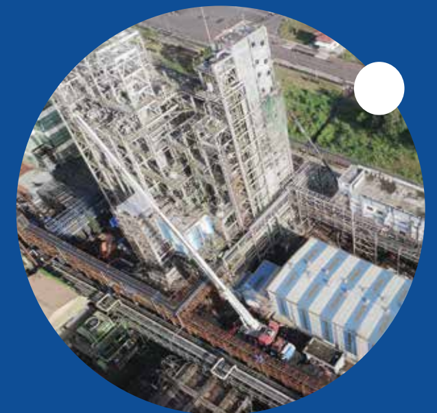
SPECIALTY CHEMICALS & OTHERS