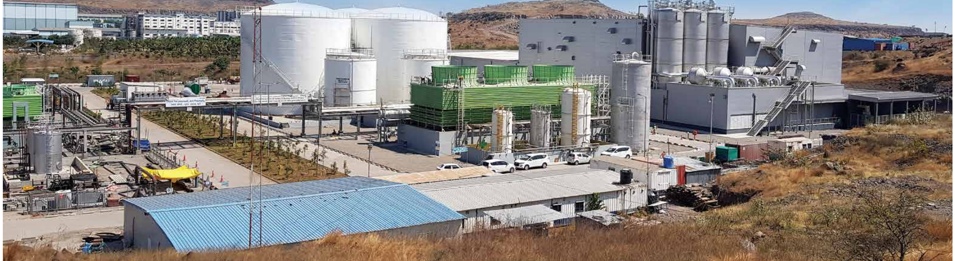
Butyl Phenol Project, Ratnagiri Client: Vinati Organics Ltd.

Wet Yeast Manufacturing Facility, Pune Client: Oriental Yeast Co. Ltd.